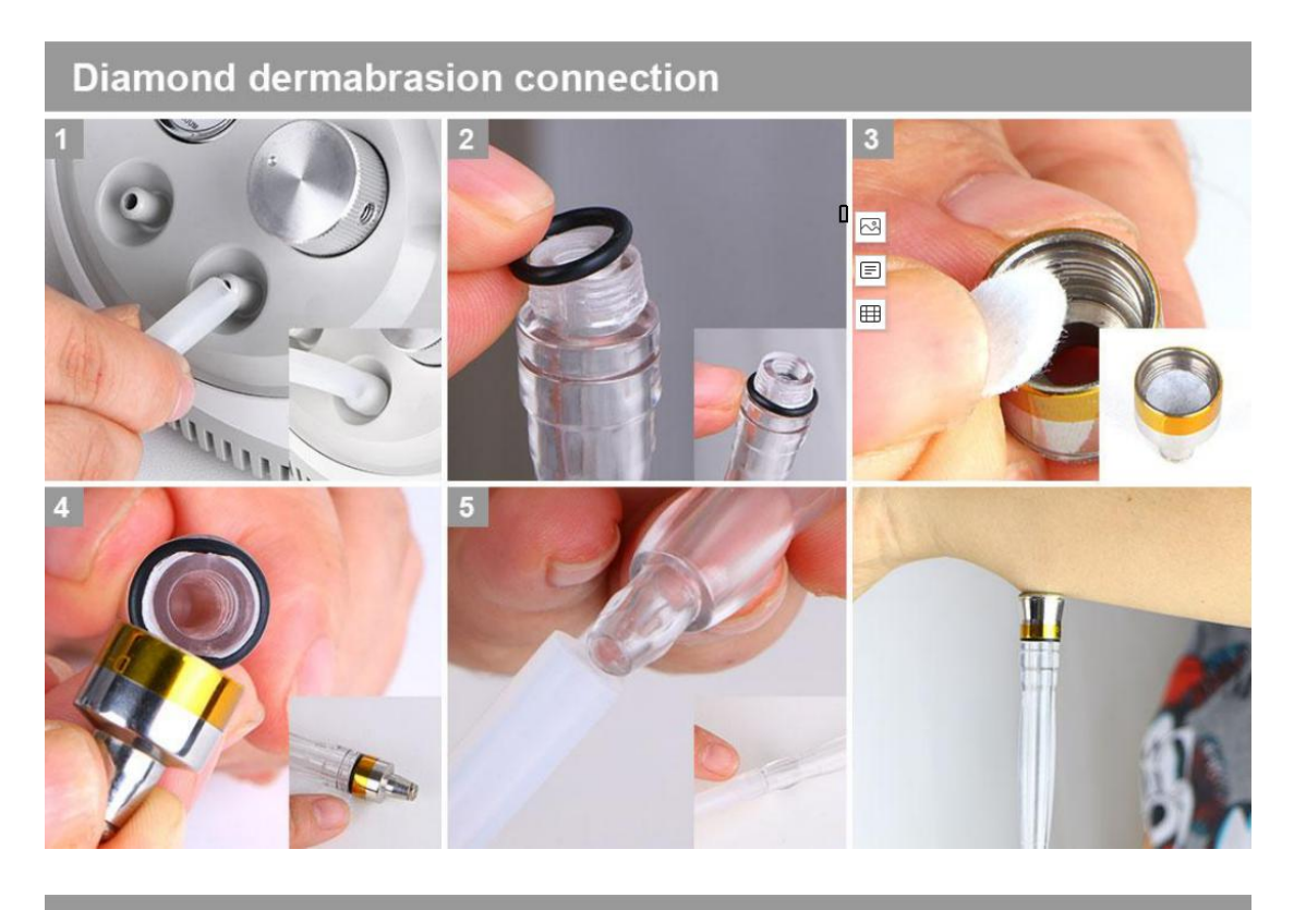
Blackhead vacuum removal connection